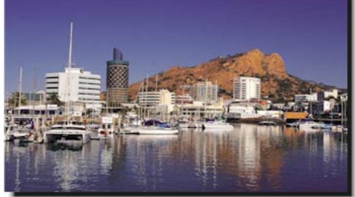
Townsville, unofficial 'Capital' of North Queensland.